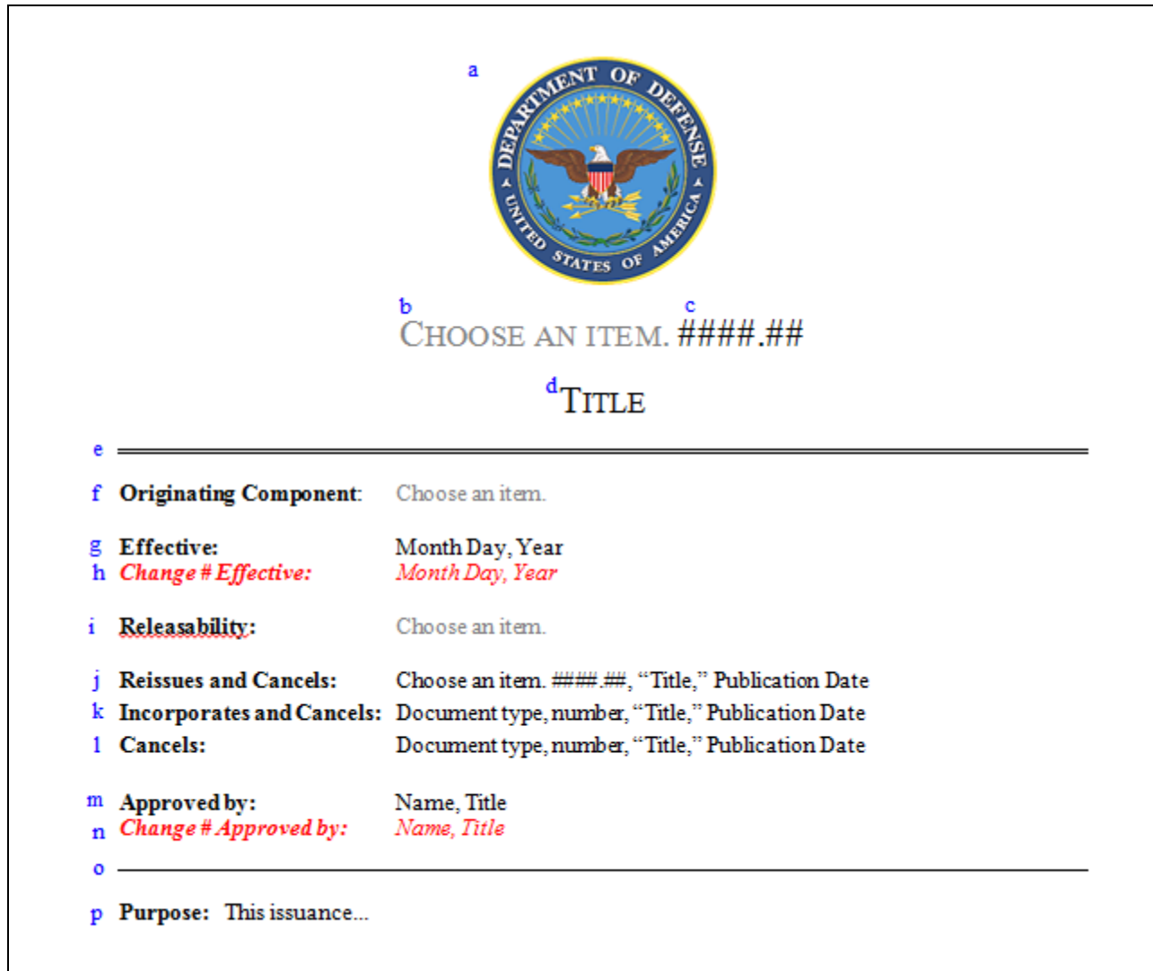
Figure 6. Sample Page 1

a. DoD Emblem. Required. The DoD emblem is centered at the top of the page. It is provided in the template. Do not remove or modify.