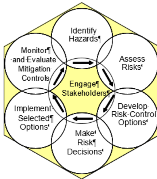
Figure. Explosives Safety Risk Management Model

(2) Evaluate the risk from identified hazards.