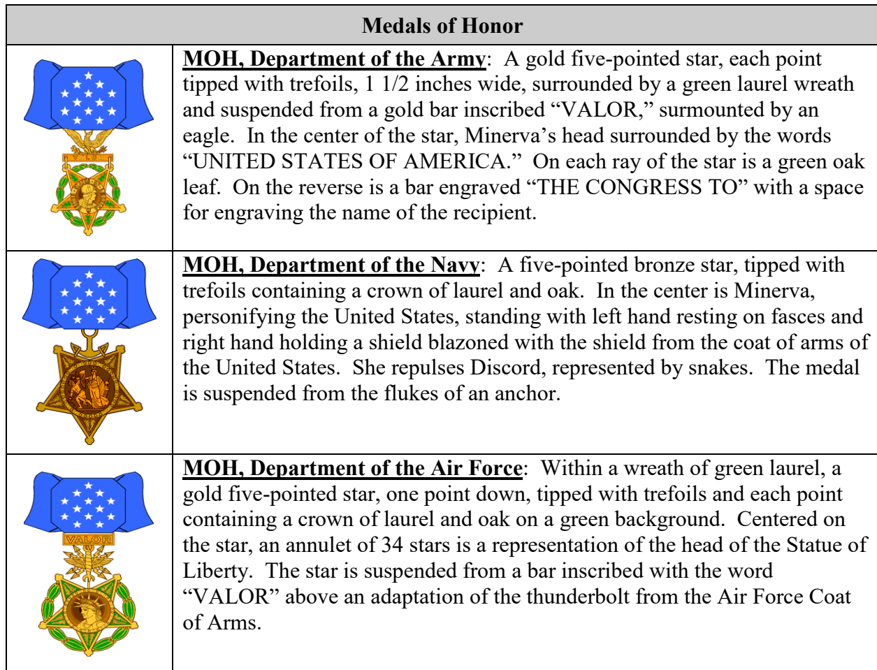
Figure 1: Illustrations of Medals of Honor