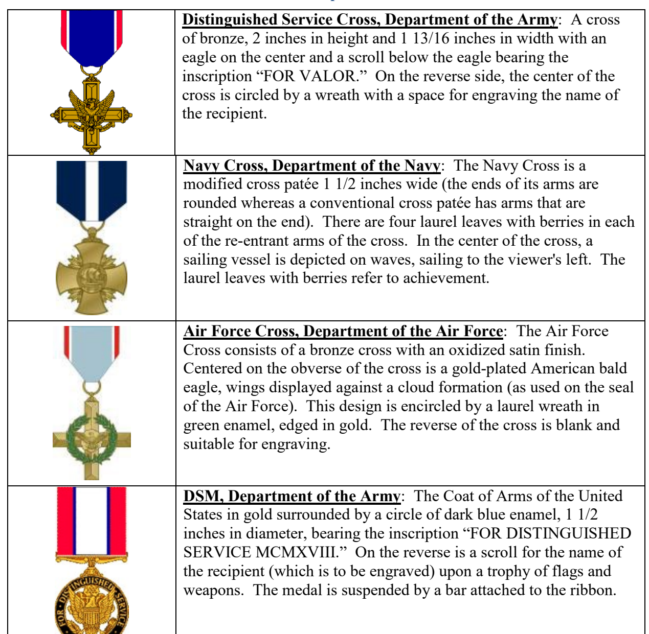
Table 1: Illustration and Description of DoD-wide Decorations