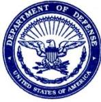
Figure 7. Sample Official Letter

SECRETARY OF DEFENSE 1000 DEFENSE PENTAGON WASHINGTON, DC 20301-1000