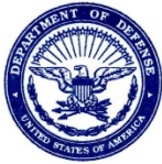
Figure 1. Sample Standard Unclassified Memorandum

SECRETARY OF DEFENSE 1000 DEFENSE PENTAGON WASHINGTON, DC 20301-1000