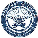
Figure 6. Sample Multi-Addressee Memorandum with Combatant Commanders

MEMORANDUM FOR CHIEF MANAGEMENT OFFICER OF THE DEPARTMENT OF DEFENSE