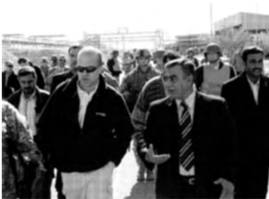
The author (in sunglasses) discusses operational details with the director of plant operations during a tour of a fertilizer plant in Bayji, Iraq, 28 February 2007.

To date, six factories have restored production operations. These factories include major industrial operations in Iskandariyah, a town thirty miles south of Baghdad on the "fault-line" of the Sunni-Shi'a sectarian divide and a hotbed of insurgent sympathies resulting from economic depression. In Najaf, a large, modern clothing factory has been restarted, restoring employment to over 1800 employees. Over 70 percent of these employees are women, including supervisors and engineering staff. The six factories represent only a small beginning. With modest sufficient funding, the task force believes it can restart dozens of factories in calendar year 2007, restoring employment to tens of thousands of Iraqis and creating significant economic uplift in wide areas of the country.