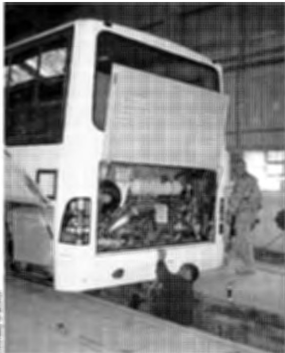
Workers assembling a bus in the SCAI bus and tractor factory, Iskandariyah, Iraq.

under UN sanctions, the CPA allowed and encouraged open international trade. This resulted in a burst of consumption by Iraqis and a corresponding rapid expansion of the retail sales sector, but had a wide range of other impacts—including further depression of economic activity in Iraqi factories, over-consumption of electrical power on a strained national electrical grid, and the near-crippling of Iraqi agriculture as cheap produce and foodstuffs poured across the border from neighboring states, especially Iran. This open trade situation has remained largely unchanged over the past four years.