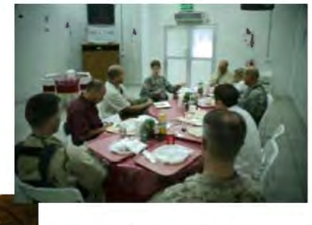
Resource Management (personnel, financials)