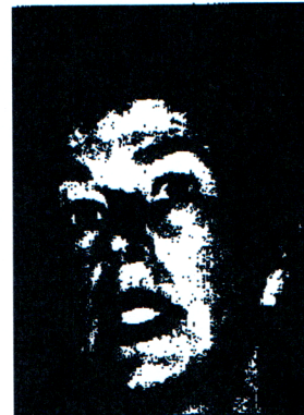
(U) Foreign Minister-Designate Barco

(S//NF) President-elect Uribe once said his new Defense Minister has the political skills of a future President. Uribe considered her for a number of different positions, including Vice President and Foreign Minister.