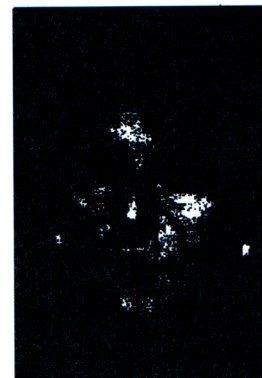
(U) Defense Minister-Designate Ramirez