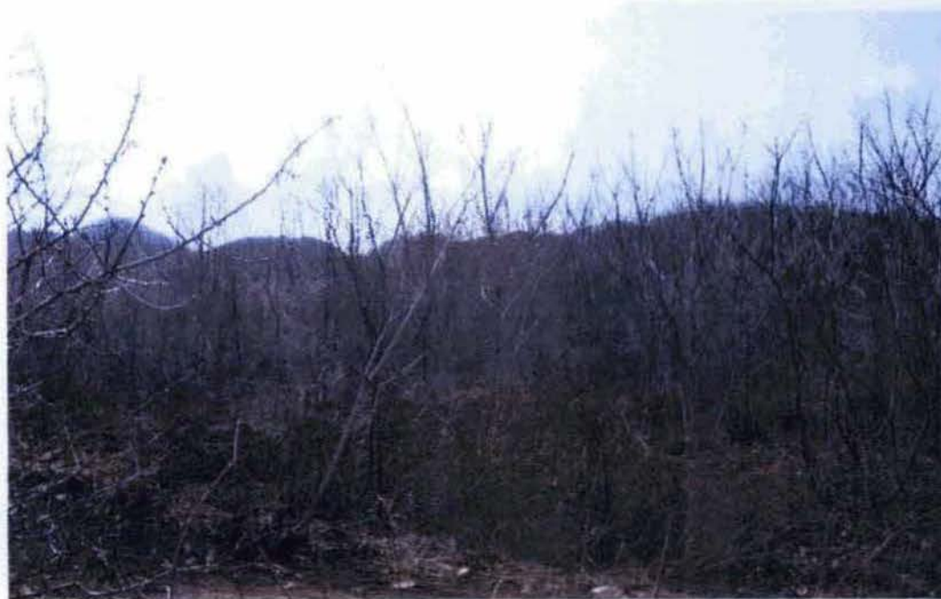
Possible Burial Area (According to locals)