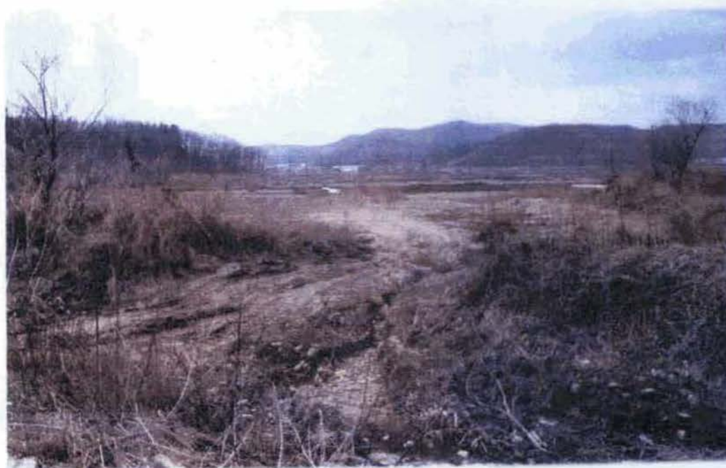
Possible Burial Area (According to locals)