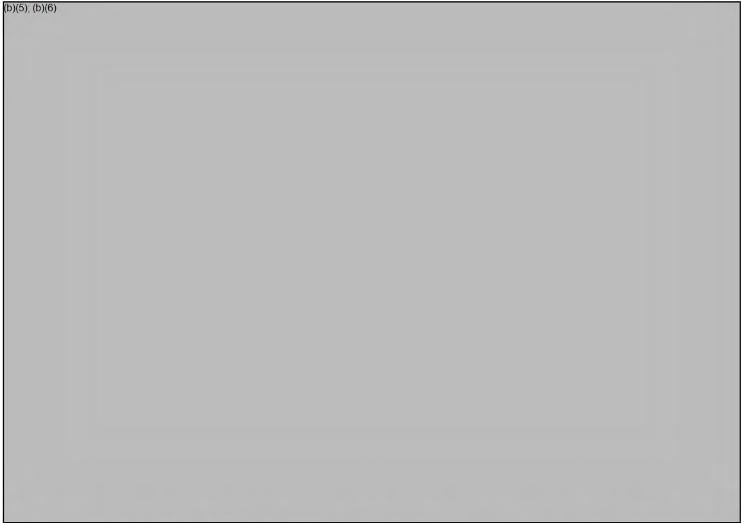
Figure 1. Overview map of Koh Tang Island showing sites KH-00220, KH-00219, KH-00207 and KH-00205 in relation to one another.