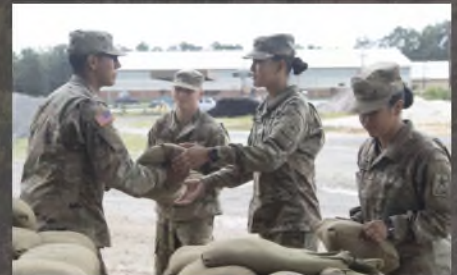
On September 5, 2019, trainees at Fort Jackson, S.C., stack sandbags for use throughout the hurricane season. The Army recently introduced a new directive to prepare the service's installations against the growing threat of climate change.