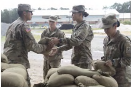
On September 5, 2019, trainees at Fort Jackson, S.C., stack sandbags for use throughout the hurricane season.

Built and natural infrastructure are both necessary for successful mission preparedness and readiness. Built infrastructure serves as the staging platform for the Department’s national defense and humanitarian missions; natural infrastructure supports military combat readiness by providing realistic operational testing and combat environments and conditions. Installations and their built and natural infrastructure also serve as the platforms from which the DOD cares for its people and projects and sustains forces. Many global operational missions are accomplished and/or sustained from DOD installations. Changing climate provides an opportunity to reevaluate use of regional approaches that allow for flexibility to adjust to changing conditions while providing an appropriate level of standardization for resilience, efficiency, and costs.