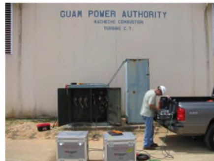
Guam Power Authority employee tests equipment for military installations on Guam.

U.S. Naval Academy (USNA)/Naval Support Academy Annapolis, Maryland: A DOD-funded resilience study (FY 20–22) will result in a comprehensive plan with specific courses of action to cohesively address and mitigate the combined effects of land subsidence, sea level rise, ground water change, coastal flooding/storm surge, and inadequate stormwater management at USNA. Courses of action will include a mix of approaches: structural (seawalls, bulkheads, floodwalls, stormwater retrofits), natural (earthen berms/levees, rain gardens, living shorelines), non-structural (changes in land use), and temporary solutions to issues where long-term permanent protection may take years to implement. The installation is in the midst of implementing additional stormwater repair projects and proposing to repair and restore the seawall and shoreline along the installation to address structural deficiencies on the existing seawall and potential impacts from future extreme weather events, storm surge, sea level rise, and land subsidence.