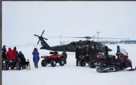
Representatives from the Alaska Department of Military and Veterans Affairs, the Department of Environmental Conservation, and the Department of Commerce, Community and Economic Development load onto an Alaska Army National Guard UH 60 Black Hawk helicopter in Chevak, Alaska, on April 9, 2021 to meet with tribal leaders and citizens in Bethel, Tuluksak, and Chevak to discuss disaster assistance measures and preparation for the upcoming flood season.