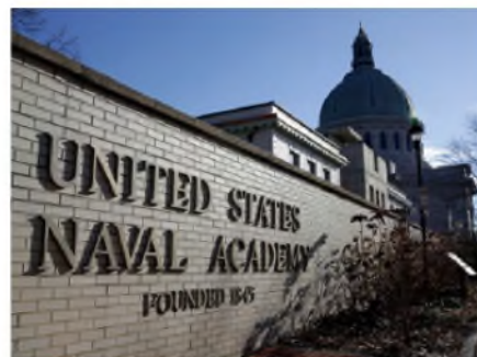
An entrance to the U.S. Naval Academy campus in Annapolis, Maryland (January 9, 2014).