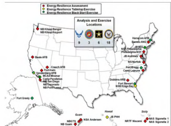
Figure 2. Site-level map of energy resilience assessment locations

Marine Corps Recruit Depot (MCRD) Parris Island: MCRD Parris Island completed a Climate Change Adaptation and Resilience (CCAR) assessment that resulted in changes to its master plan projects and adaptation strategies from spatial planning; to redirecting development away from high-risk areas; to infrastructure projects to manage and respond to sea level rise and effects of climate change. Adaptation projects include stormwater system upgrades, battalion training facilities elevation (main campus), road network upgrades, tidal exclusion barrier, page field training facilities relocations, and reforestation.