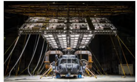
An HH-60W Jolly Green II sits under bright lights used to create heat in the McKinley Climatic Lab at Eglin Air Force Base (AFB), Florida (March 19, 2020).

DOD must have prepared combat forces capable of operating under the most extreme and adverse weather and terrain conditions. The nonlinear impacts of climate change require us to expand this work by anticipating, training, and equipping for emerging environmental conditions different from the range of environments existing today. This includes compounding effects of climate hazards together or with other disruptions (e.g., pandemic). The evolving operational environment and the need to operate in new, more extreme environments may require changes to where and how U.S. Forces train for future conflict. The need for new and advanced training systems capabilities may be necessary to meet readiness requirements. This will be reflected in the Department's efforts across activities related to developing, acquiring, fielding, and sustaining equipment and services. DOD will develop a list of adaptation concepts to test in crises action planning, tabletop, and command post exercises. Integrating adaptation concepts into existing major exercises informs the joint force on how to adjust current operational and contingency plans, while identifying scenarios that should have their own individual plan.