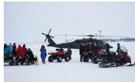
Community members of the city of Chevak, Alaska, meet with tribal leaders and citizens to discuss disaster assistance measures and processes in light of recent emergencies in preparation for the upcoming flood season.

Instituting effective and efficient climate adaptation over the range of DOD missions, operations, and infrastructure requires leveraging all relevant information, methods, technologies, and approaches. This can only be achieved through close collaboration with others. The Department will build unity of effort and mission across DOD components, commands, services, and theaters to exploit lessons learned and economies of scale. Close cooperation with all who have a stake in our national security (other federal agencies, Congress, private industry, academia, NGOs, the American people, and allies), as well as other nations, will help secure our common interests and promote our shared values.