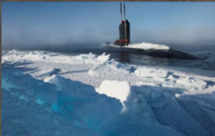
The submarine USS Hartford surfaces near ice Camp Sargo during Ice Exercise 2016 in the Arctic Circle, March 19, 2016.