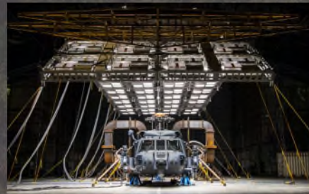
An HH 60W Jolly Green II sits under bright lights used to create heat in the McKinley Climatic Lab March 19 at Eglin Air Force Base, Florida. The Air Force's new combat search and rescue helicopter and crews experienced temperature extremes from 120 to minus 60 degrees Fahrenheit as well as torrential rain during the month of testing. The tests evaluate how the aircraft and its instrumentation, electronics and crew fare under the extreme conditions it will face in the operational Air Force.