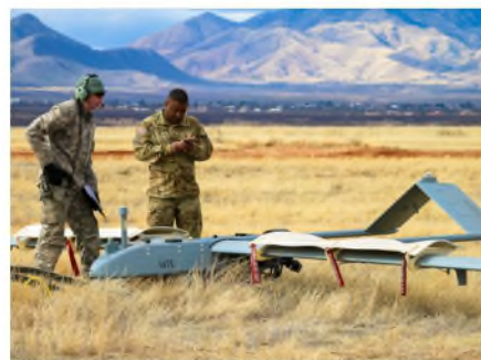
Soldiers conduct unmanned aerial system training for readiness-level progression at Fort Huachuca.