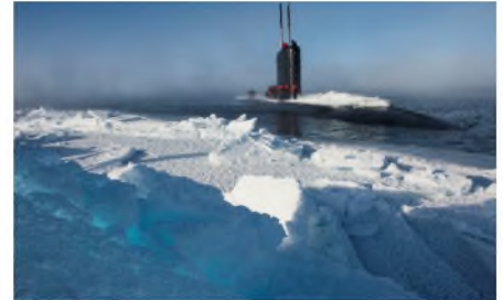
The submarine USS Hartford surfaces near Ice Camp Sargo during Ice Exercise 2016 in the Arctic Circle, March 19, 2016.

Climate considerations must continue progress toward becoming an integral element of DOD's enterprise-wide resource allocation and operational decision-making processes. Climate assessments must be based on the best available, validated, and actionable climate science that informs the most likely climate change outcomes. Climate data sources must be continuously monitored and updated—with consideration of the operational impact—to account for the rapid rate of climate change and its impacts. All other actions in this plan are dependent on the outcomes of this effort.