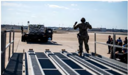
Air Force Airman loads pallets of water into a C-17 Globemaster at Joint Base San Antonio-Kelly Field, Texas.

A climate-resilient supply chain is one in which the Department has ensured that key suppliers and industries can still operate though impacted by climate change. DOD must also consider logistic support of supply chains (e.g., fuel, power requirements) especially in austere locations that are more vulnerable to the effects of climate change. To remain agile and flexible in responding to changing conditions, actions will include energy demand reduction to reduce logistics requirements and establish metrics and measures for tracking progress. The DOD acquisition system must consider operational energy as stated in the Operational Energy KPP (10 USC 2911) that reduces the logistical footprints of contingency locations. Other optimization of logistical support requirements (e.g., water) can improve resilience and make supply lines less vulnerable to the effects of climate change and adversaries.