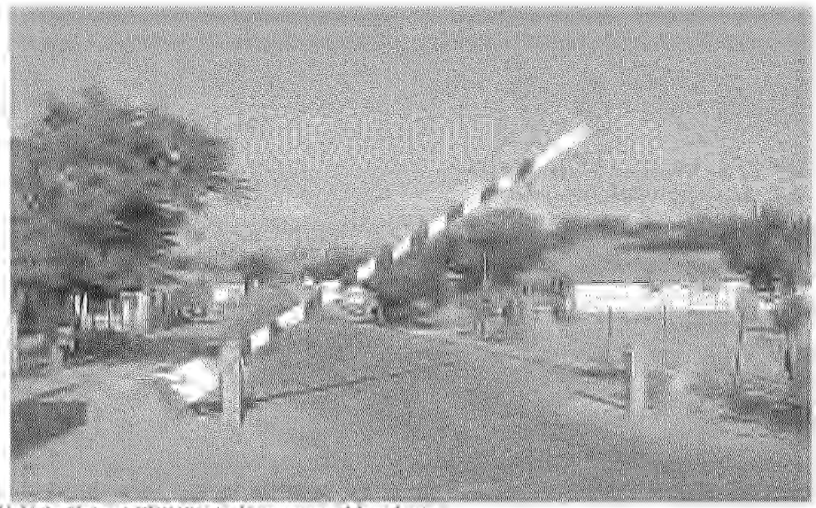
Main Vehicle Gate at 1005 Site in Kumanovo, Macedonia