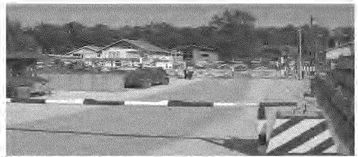
Main Vehicle Gate at Camp Oden in Bosnia