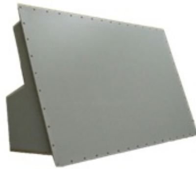
Planar Array Antenna Assembly (PAAA)