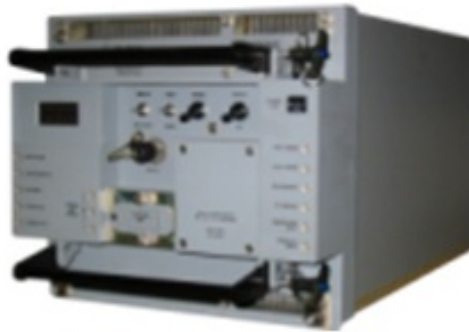
Signal Data Processor with Sierra Chip (SDP-S)