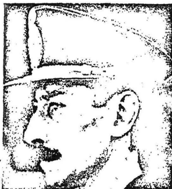
Lt Gen Jorge Videla

(C/Veron) While the junta has taken collective credit for the move against Mrs. Peron, the unquestioned leader and head of the junta is Army Commander Lt Gen Jorge Videla. A self-efacing infantryman, Gen Videla has spent most of his career in staff and teaching assignments. He has had contact with several generations of officers while serving as Director of the Military Academy and is said to be widely respected. A professional soldier, he is known