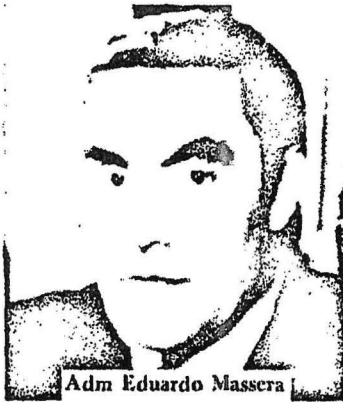
Adm Eduardo Massera

DECLASSIFIED IN PART Authority: EO 13526 Chief, Records & Declass Div, WHS Date: APR 13 2018