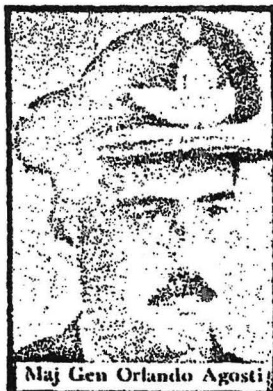
Maj Gen Orlando Agosti

He enthusiastically recalls his assignment to Washington as advisor to the Argentine delegation at the Inter-American Defense Board and as a student at the Inter-American Defense College from 1963 to 1964. Adm Massera visited the US Chief of Naval Operations and received the US Legion of Merit a year ago February.